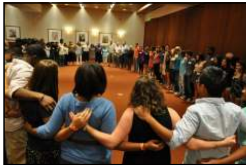
30 Year Camp Reunion

We celebrated 30 years of Camp CommUNITY/Anytown, TX on August 14 at the Fort Worth Museum of Science and History. Past Delegates, Leadership, and their families reminisced and celebrated the success of camp. As part of the celebration, we paused to remember those in our camp family who are no longer with us. We ended the day by revealing the top "Circle Sing Songs" as voted by past Delegates and Camp Leadership. We sang the number one song: Lean On Me . Thanks to all who helped celebrate the power of camp!