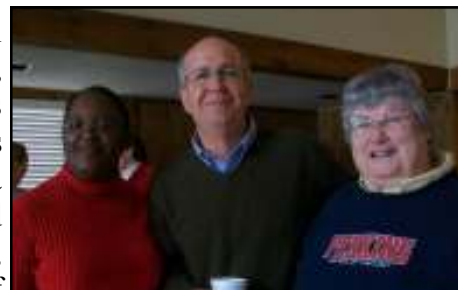
2011 Seminary Retreat Participants

Forty-four students and faculty attended the 24 th annual Seminarian Interfaith Retreat this past January. The theme, “Hospitality: Abraham Welcoming the Angels”, was explored from three Abrahamic faith traditions. Students from seminaries in Texas, Connecticut, and California gained a greater appreciation, understanding and knowledge of their own faith and a deeper appreciation, understanding and knowledge of the faith path of others. The students identified common ground and differences in religious ideology and personal practice, and built a community of clergy who have become treasured colleagues.