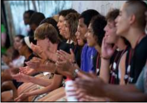
2011 Camp CommUNITY Delegates

In June the Multicultural Alliance held the 30th Camp CommUNITY. Thanks to the 19 dedicated and experienced volunteer staff, 49 students representing 23 area high schools became part of the life-changing camp legacy. This year the camp included 29 high school juniors and 20 seniors. This youth diversity leadership program is a five-day residential camp for entering 11 th and 12 th grade high school students. The students focus on leadership development through heightened awareness, building friendships, promoting positive social change and developing valuable relationships as they explore commonalities and differences. We ask that you consider recommending a student to attend Camp CommUNITY 2012. Please contact us for more information about recommending a participant or sponsoring a student to attend.